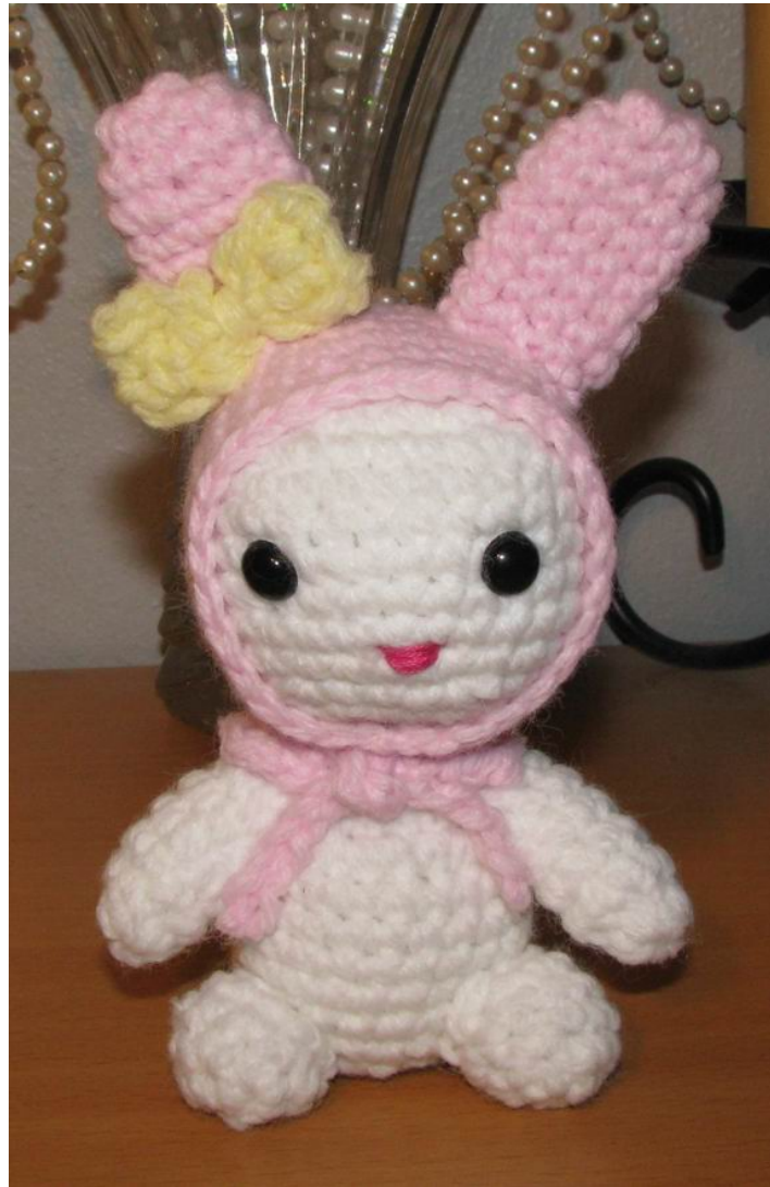
My Melody Look-alike Doll