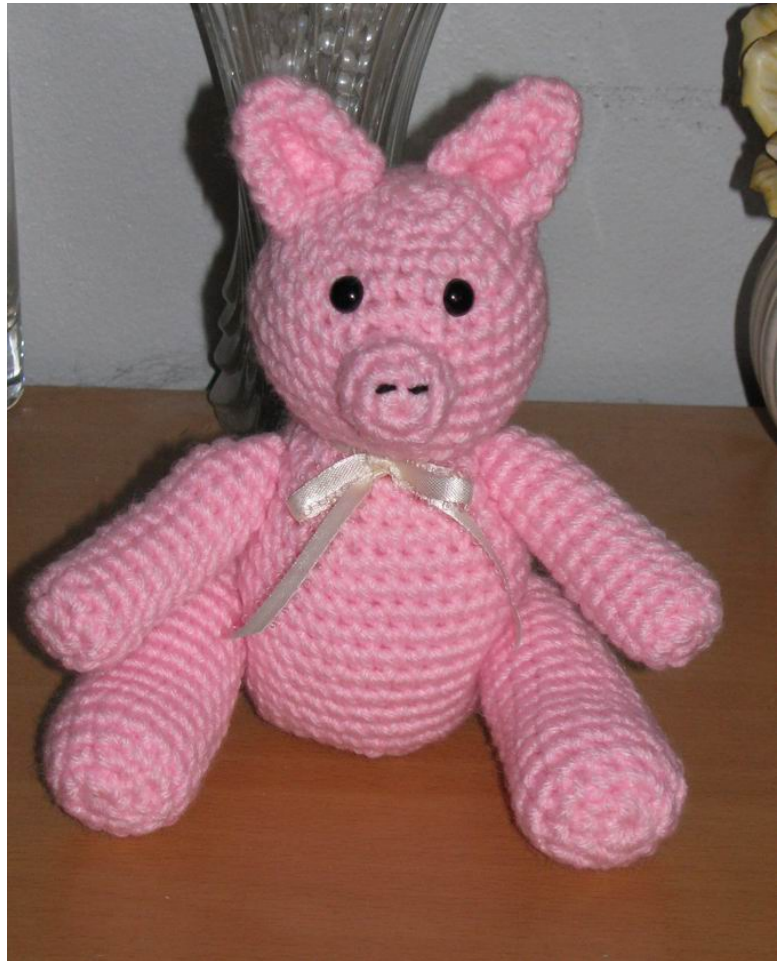
Amigurumi Piggy Thread Jointed